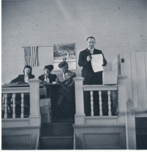
at the Old Town House

Razorville Hall and the Old Town House will be open for visitors.